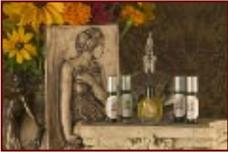
Divine Alchemy from the Goddess