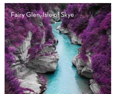
Fairy Glen, Isle of Skye