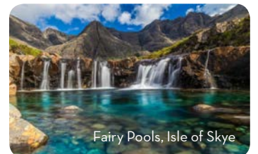
Fairy Pools, Isle of Skye