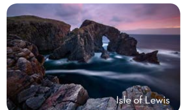
Isle of Lewis